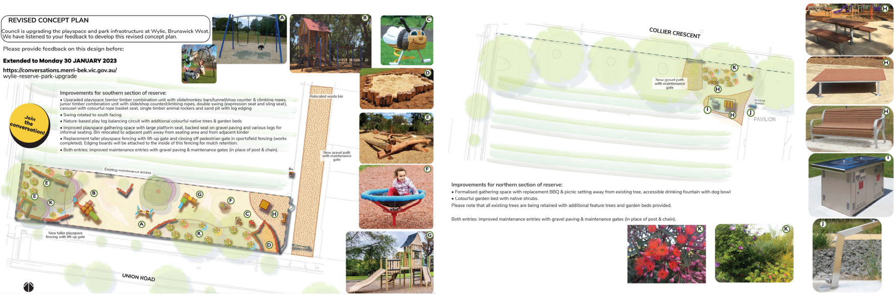
Figure 5: Posters displayed at site and on Conversations webpage.

Below are posters displayed at site and on Conversations webpage.