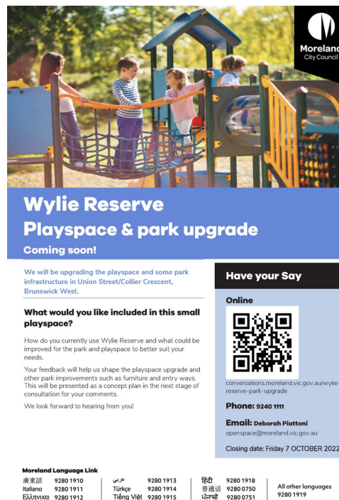
Figure 1: Poster displayed at site (similar versions with QR codes were provided to the adjacent kindergarten and primary school).