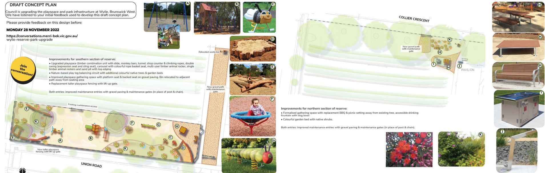
Figure 3: Posters displayed at site and on Conversations webpage.

Below are posters to be displayed at site and on Conversations webpage and posters to be delivered to local residences.