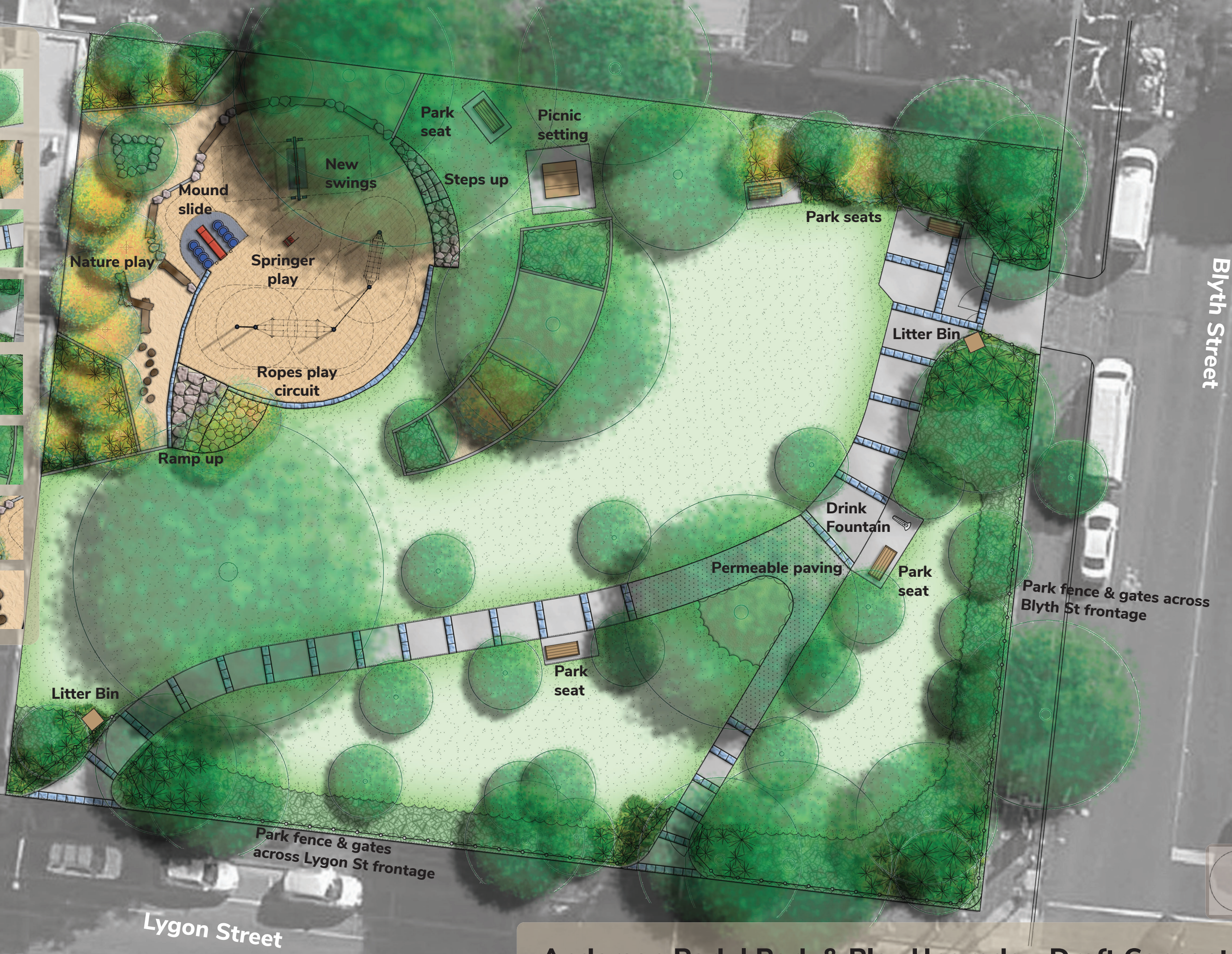
Anderson Park | Park & Play Upgrade - Draft Concept Plan