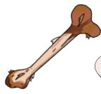
Meat, bones, seafood