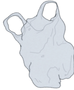
Plastic bags or soft plastics