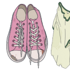
Old clothing, shoes or textiles