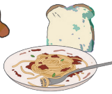
Bread, meal leftovers