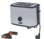
E-waste or hazardous materials