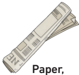
Paper, newspaper, magazines