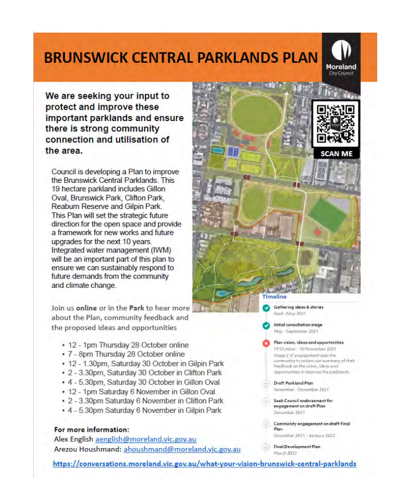
Figure 2: Stage 2 poster displayed throughout the Parklands