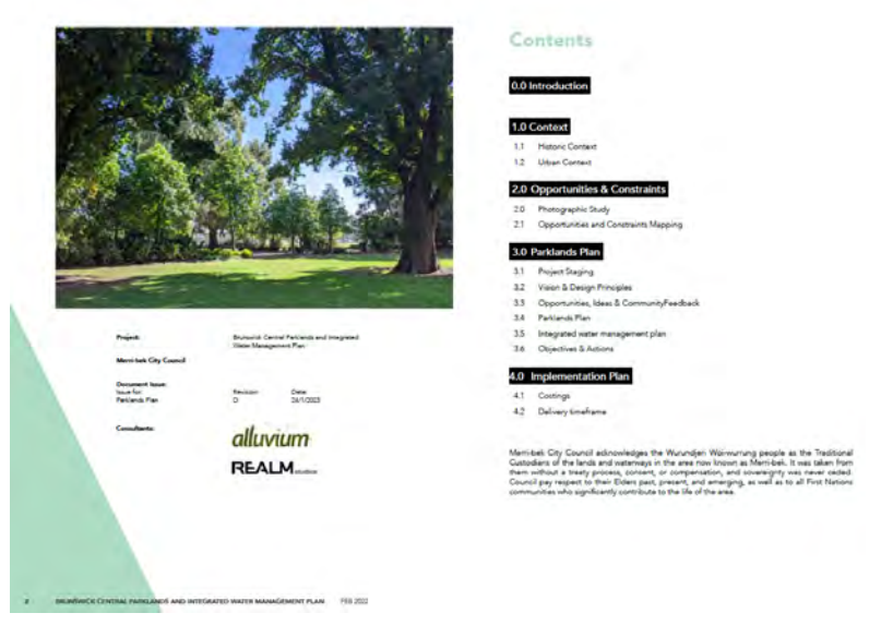
Figure 7: Final Brunswick Central Parkland & Integrated Water Management Plan on CM Website