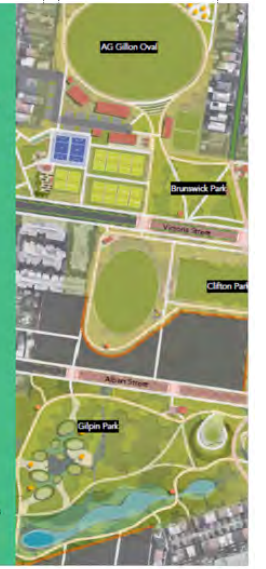
Figure 4: Stage 3 community engagement postcards distributed to 2,600 households within 500m of the Parklands.

We are available to discuss the Plan with residents who cannot attend the info sessions. Email: aenglish@moreland.vic.gov.au Call 9240 1111