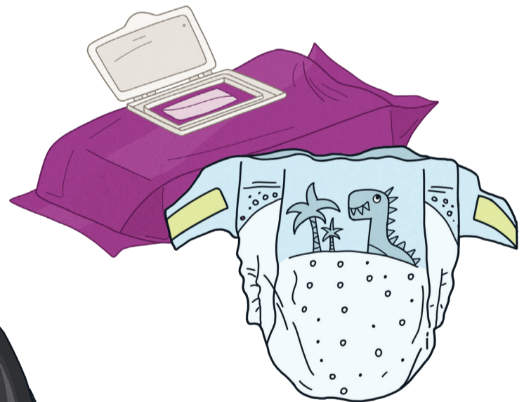
Nappies and wet wipes