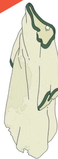
Old clothing or textiles that cannot be repaired