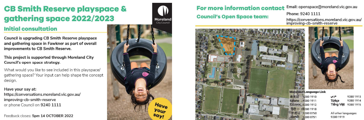
Figure 2: Postcards issued to households within 1km of site.