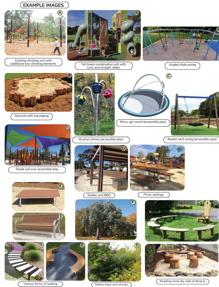
Figure 4: Posters displayed at site and on Conversations webpage.