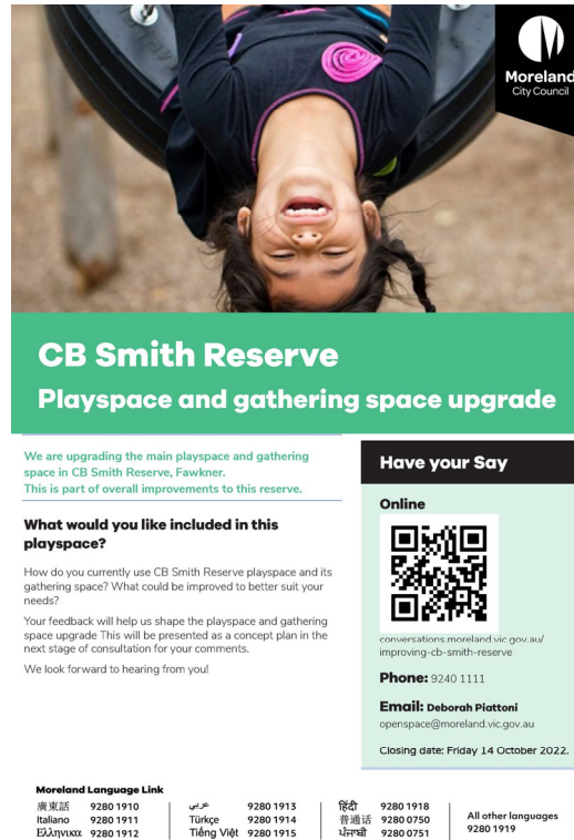
Figure 1: Poster displayed at site.