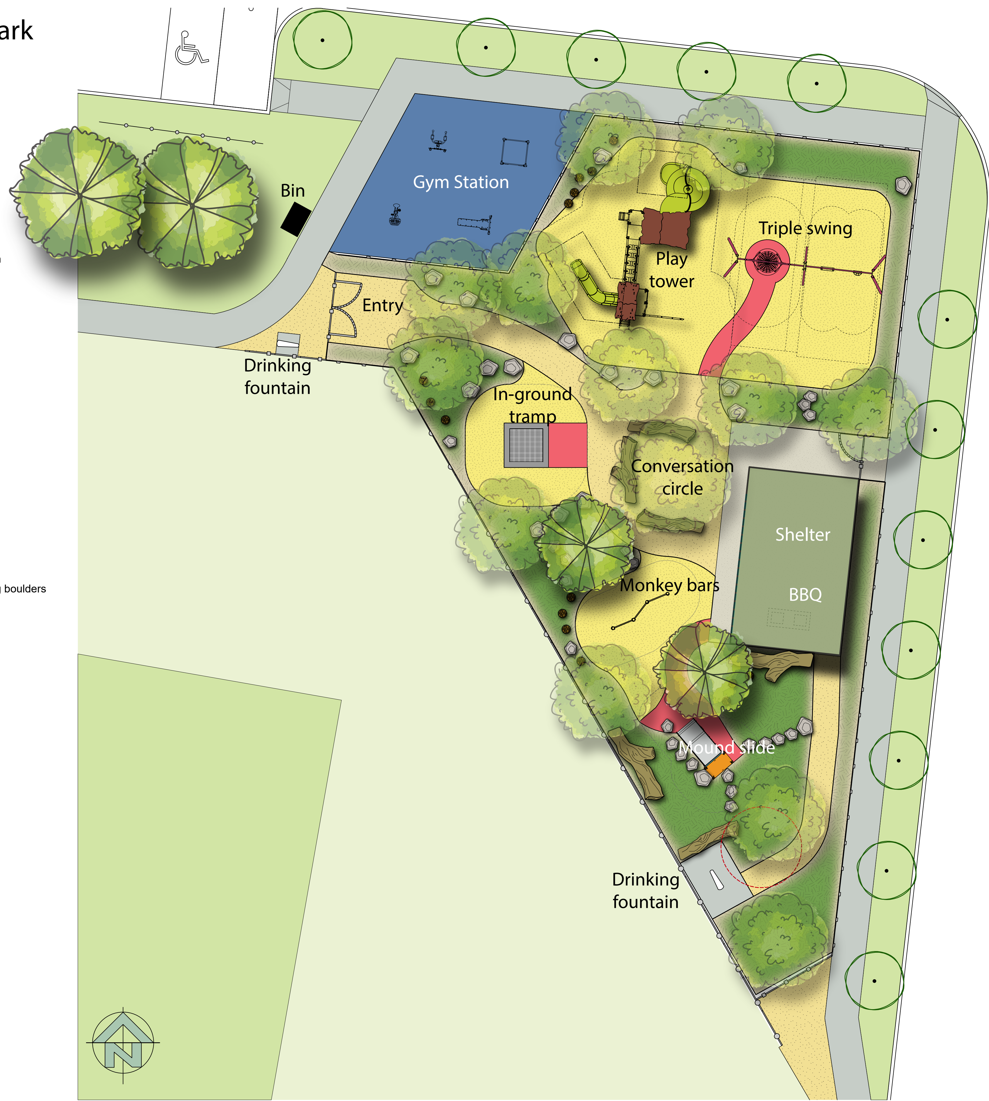
L01 Play space - Detail 1:100