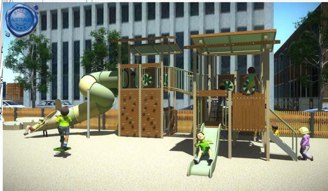
"Adventure" Combination play unit Typical example - artist impression Maximum Height 5.0 metres (approx.)